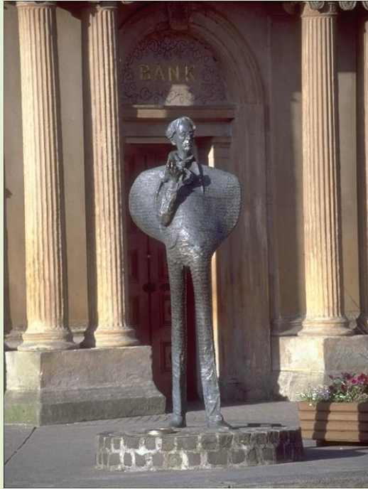
All rights reserved

The 6 th iYeats Poetry Competition, organised by the Hawk's Well Theatre in Sligo, is accepting applications until Wednesday, 9 July 2014.