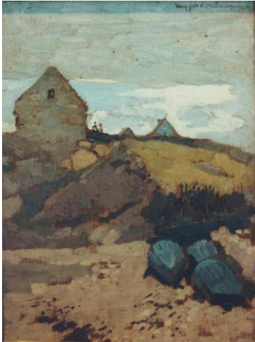
Dawn Light – Copyright: Diarmuid Ó Ceallacháin