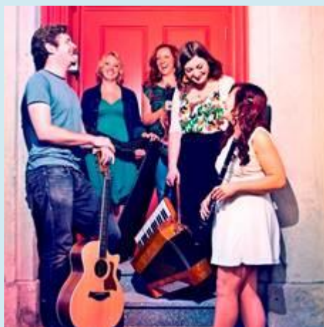
All rights reserved

The Outside Track will return to Germany on 29 January for a tour at a venue near you. The celebrated Irish/Scottish/Canadian quintet mixes traditional music with a modern touch to produce a truly unique sound.