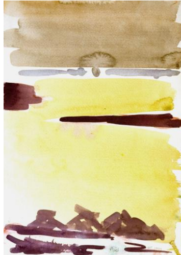
Piles of Turf

The Embassy will host a reception on Thursday, 26 February to launch “Súil Síar –Two Generations paint the West of Ireland”.