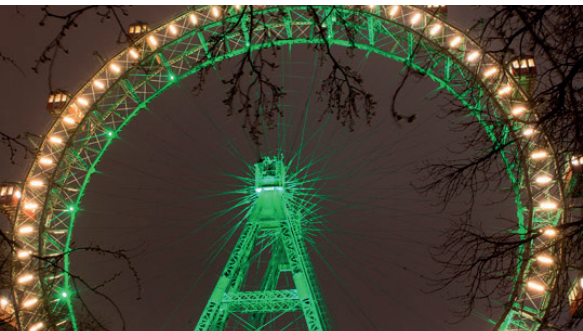
Riesenrad goes Green

New York and the tallest building in the Western Hemisphere – will join Tourism Ireland's Global Greening initiative for the first time. It will be joined in this the eight year of the Global Greening by some old favourites like the Colosseum in Rome, the Sacré Coeur basilica in Paris, the Great Wall of China, Niagara Falls and the Christ the Redeemer statue in Rio de Janeiro and of course the Riesenrad in Vienna, which will turn green on the 7th of March.