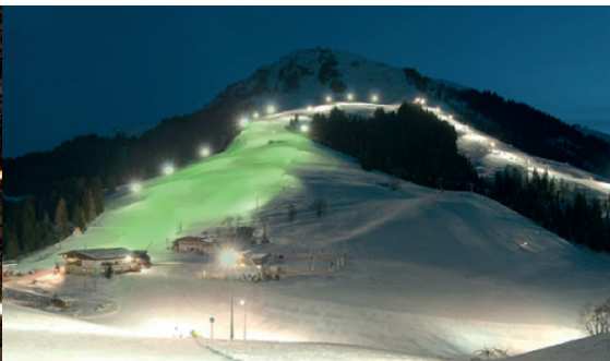
Skislope, SkiweltSöll, Tirol