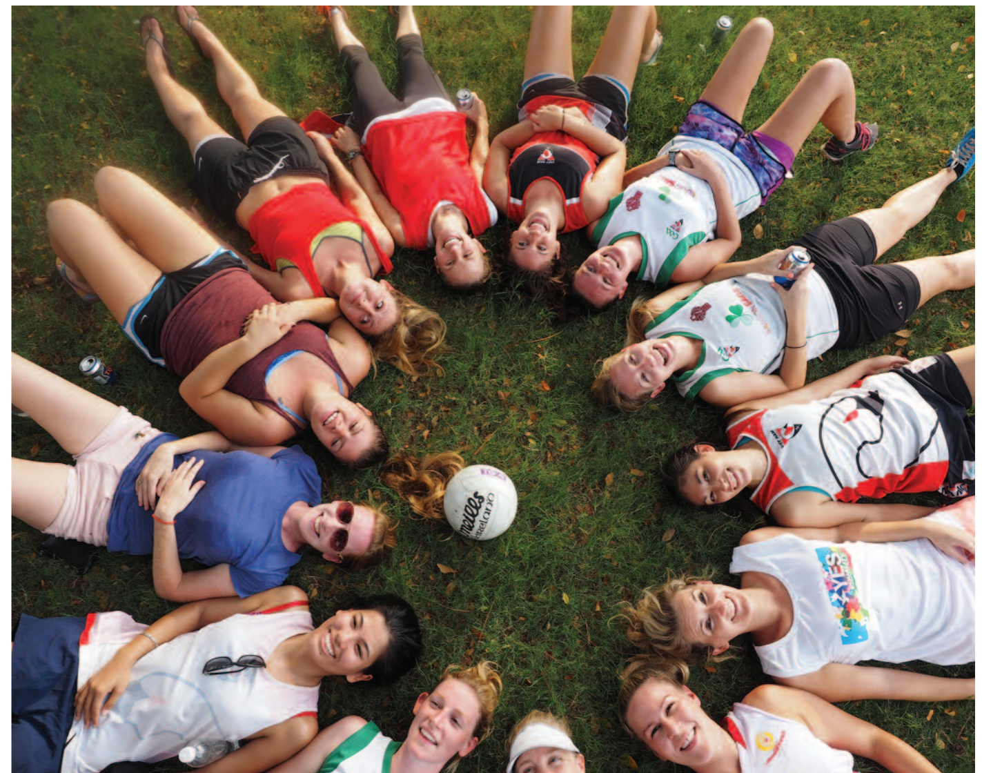
Saigon Gaels, an Irish Gaelic football club in Ho Chi Minh City

There is a growing Irish community in Vietnam (600) and a small active Irish community in Cambodia and Lao PDR. In addition, the number of Irish visitors to Vietnam and the Mekong Sub-region continues to grow (approximately 15,000 people per annum). There is an active inter-country adoption agreement between Ireland and Vietnam. There are also a growing number of applications for business and study visas to Ireland from Vietnamese citizens.