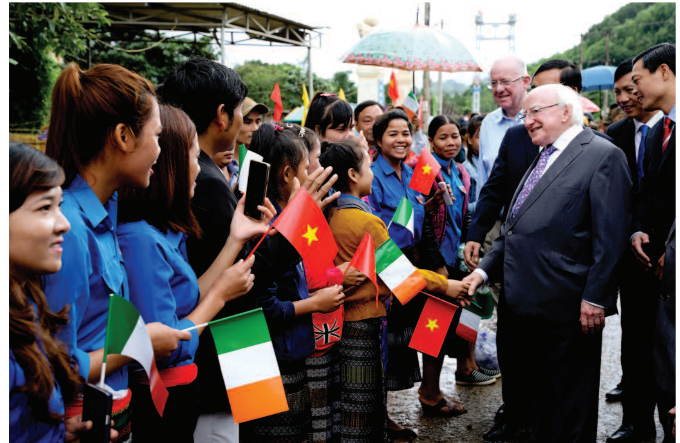
President of Ireland Michael D. Higgins, accompanied by Minister of Foreign Affairs and Trade Mr. Charles Flanagan, T.D., met with ethnic minority communities in Vinh O commune, Quang Tri province. The State visit in November, 2016 marked twenty years of diplomatic relations between Ireland and Vietnam and provided an exceptional promotional opportunity for Ireland, which the Embassy worked to ensure was harnessed to the maximum effect

The Embassy will use traditional and social media platforms to communicate and grow Ireland's positive reputation, create a distinctive identity and enhance the way people view our country in Vietnam. These platforms will deliver information in a timely fashion on services available including in relation to passports, citizenship and visas; explain the work of the Embassy, Irish foreign policy and key values; and showcase Ireland's rich cultural heritage and promote Ireland as a high quality destination for tourism and education and as a reliable and innovative business partner.