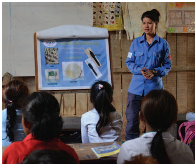
Irish Aid supports humanitarian mine action and the clearance of unexploded ordnance in Vietnam, Cambodia and Lao PDR. This is a HALO Trust Clearance and Mine Risk Education session in Cambodia.