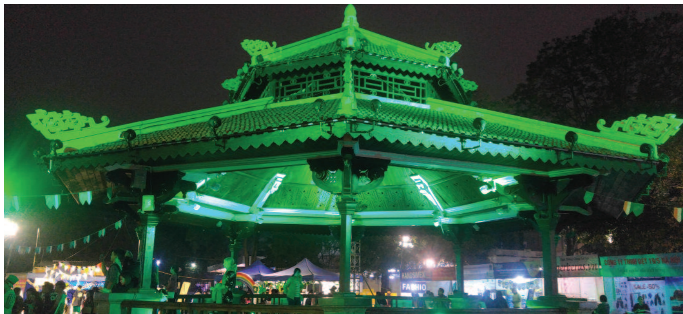
Hanoi became the first city in South East Asia to join Ireland's Global Greening Campaign 2017 and Ly Thai To Park has become the 100th landmark in the world to go green for St. Patrick's Day, together with iconic landmarks in 35 countries

In a region with a vibrant cultural life, Irish culture, arts and sport can be leveraged to great effect to increase the visibility of Ireland and build bilateral relationships. There are active Gaelic Athletic Association (GAA) clubs in Hanoi and Ho Chi Minh City. The Ireland Vietnam Alumni Network now has nearly 200 members with networks in Hanoi and Ho Chi Minh City and a 'friends of Ireland' group on social media networks is growing quickly.